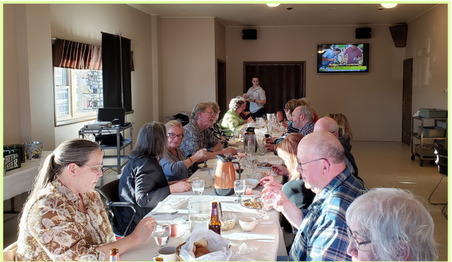
Ready for dinner!